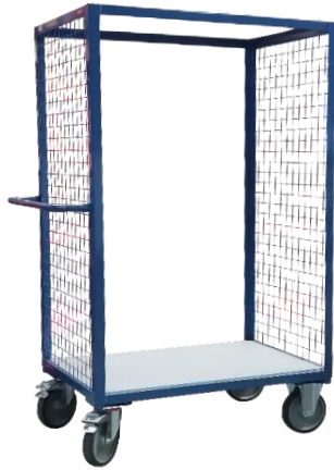
Wire mesh 2 sides