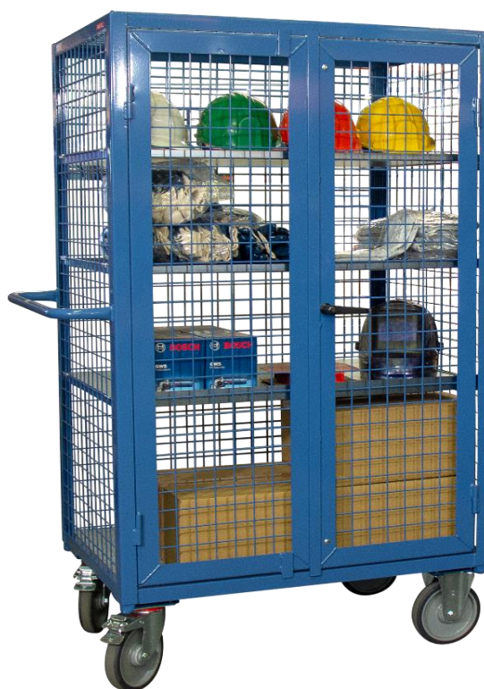
880 005 308 with 3 shelving options

Workshop cart can be locked by a handle equipped with a lock - 1 key provided