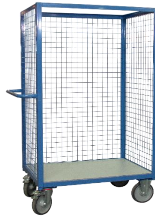
Wire mesh 3 sides