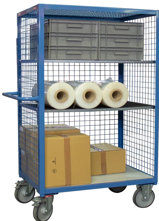
880 005 306 with 2 shelving options