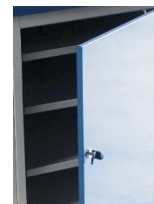
882 006 037 Additional shelf for door unit. Max. 4 shelves with 9 possible