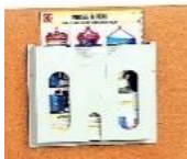
802 000 001 Document holder self-adhesive