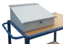
882 006 039 Table top desk with lockable writing tablet 440