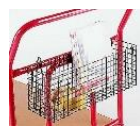
802 000 002 Wire basket