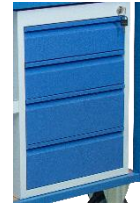
Drawer block 470 x 625 x 620 mm 2 drawers Height 100 mm 2 drawers Height 150 mm 1 set of 2 keys