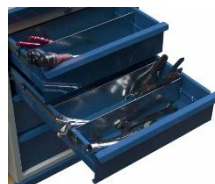
882 006 036 Partitions for drawers 100 mm high, i.e. the first 2 drawers.