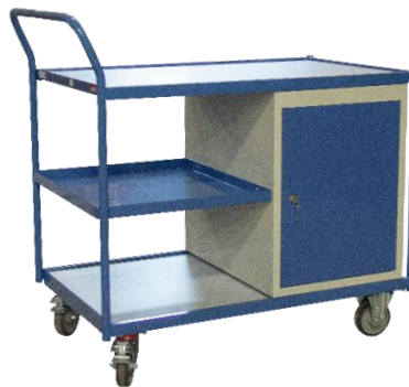
1/2 sheet metal tray + 1 door