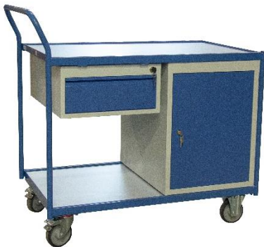
1 drawer + 1 door unit