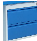
882 006 038 2 additional drawers, delivered assembled Dimensions 460 x 600 x 380 mm