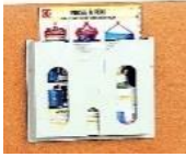
802 000 001 Document holder self-adhesive