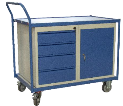
1 drawer unit + 1 door unit