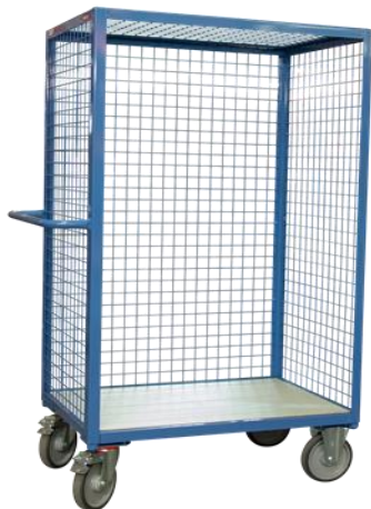
Wire mesh 3 sides with roof