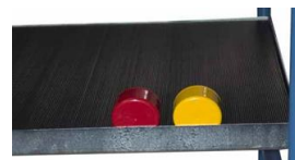
882 006 700 Melamine shelves 1000 x 700 mm Non-slip rubber-coated tray Weight : 7 kg