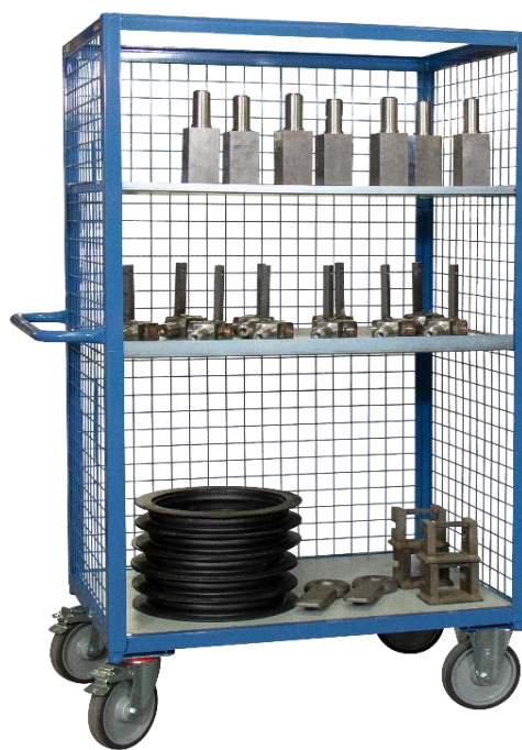
880 005 304 with 2 shelving options