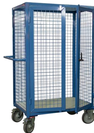
Fully screened and lockable