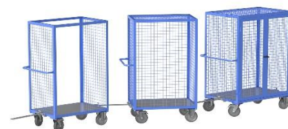
Trolleys can be linked together, with cladding adapted to your requirements